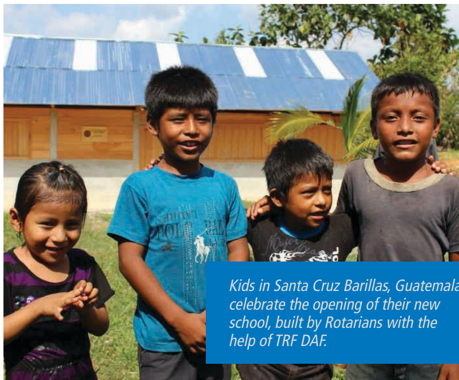
Kids in Santa Cruz Barillas, Guatemala celebrate the opening of their new school, built by Rotarians with the help of TRF DAF.

Each July, the account will make a transfer to Rotary's Annual Fund in the amount of 1% of the value of the account.